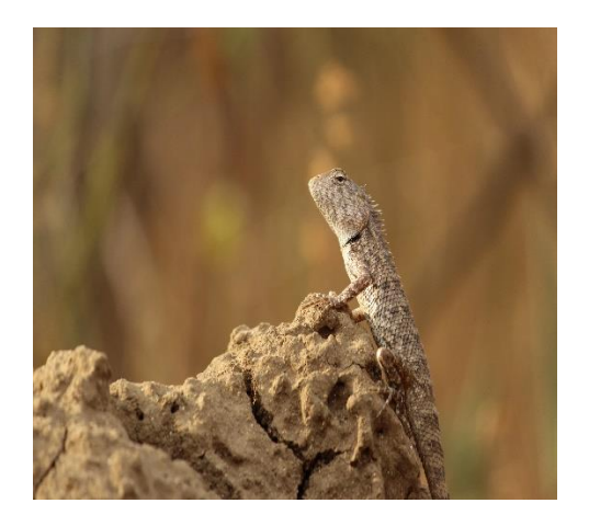
Fig 1 – Winners of Photography competition